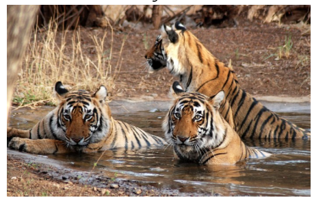
Khangchendzonga National Park