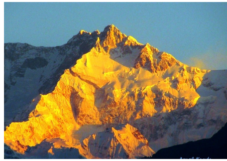
Sunrise at Mt. Khangchendzonga viewed from Pelling