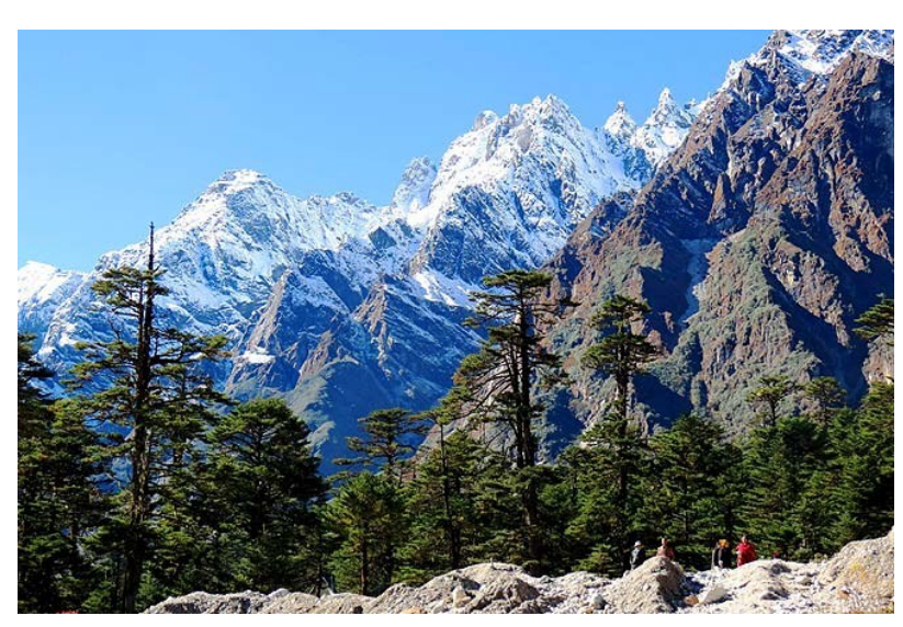
Khangchendzonga National Park

Tsomgo Lake, also known as Tsongmo Lake or Changu Lake, is a glacial lake located at a distance of 40 kms from Gangtok. Situated at an elevation of 3,753 metres, the lake remains frozen during the winter season. The lake surface reflects different colours with change of seasons and is held in great reverence by the local Sikkimese people. Yumthang valley, Lachung hill station and Pelling town (famous for unparalleled views of Mt. Khangchendzonga at dawn) are some of the other tourist attractions near Gangtok.