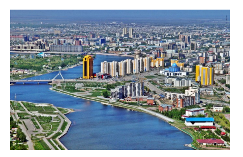
Ambassador Inaugurates a New Indian Restaurant "India Gate" in Astana

Visit us: indembastana.in www.facebook.com/IndiaInKazakhstan Twitter @indembastana